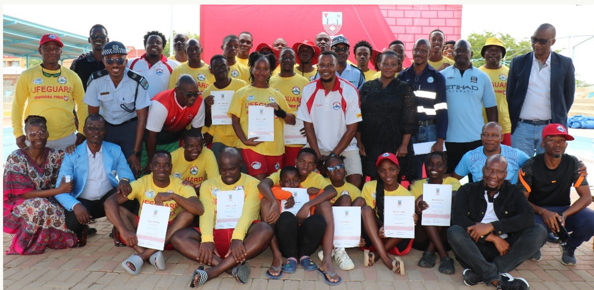
Participants proudly displaying their certificates after graduating.