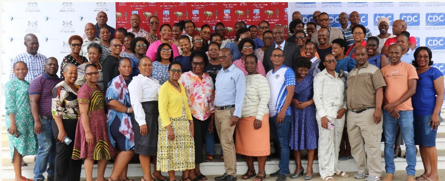
Participants of the Global Women's Breakfast held at the UB Conference Centre posing for a group photo after the event.

Programme designed to address critical gaps in leadership within nursing and midwifery professions