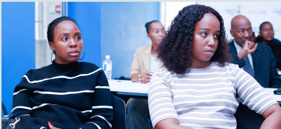
Some of the Motshameko O Phepha Scholarship recipients.