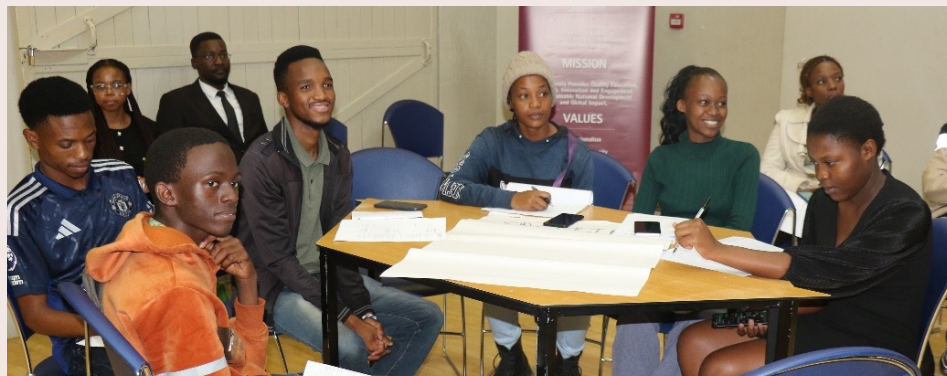
Some of the participants of the conference on the role of faith in addressing inequality.

» Professor Shoko sheds light on the intersection of religion and gender inequality in southern Africa