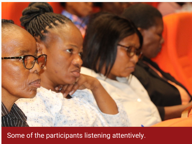
Some of the participants listening attentively.

critical gaps in leadership within the nursing and midwifery professions to cultivate a culture