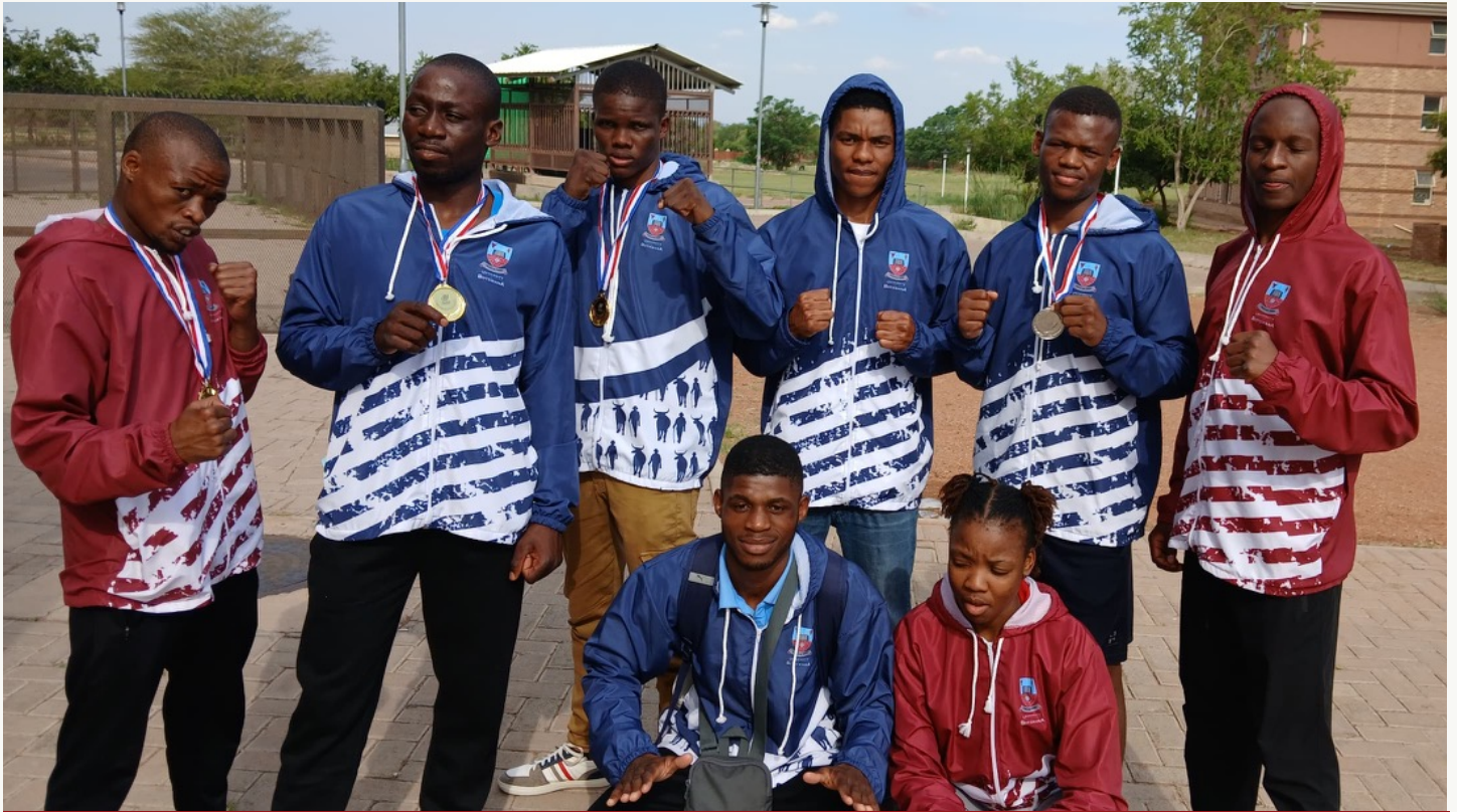
UB Boxing Team put up a splendid performance to win three Gold medals and top honours.