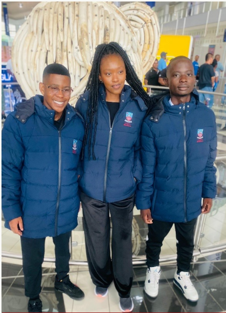
The three students before departure at the Sir Seretse Khama International Airport.

Once-in-a-lifetime opportunity to expand horizons, connect with global leaders