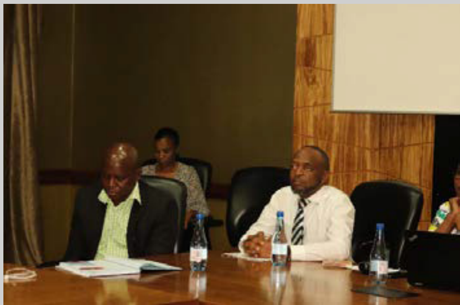
Some members of UB Management listening attentively to the proceedings.

enhancing the executive management proficiency in media engagement. Furthermore, she indicated that the training was part of an ongoing process of revatilisising the institutions internal and external communications to foster cohesion among stakeholders.