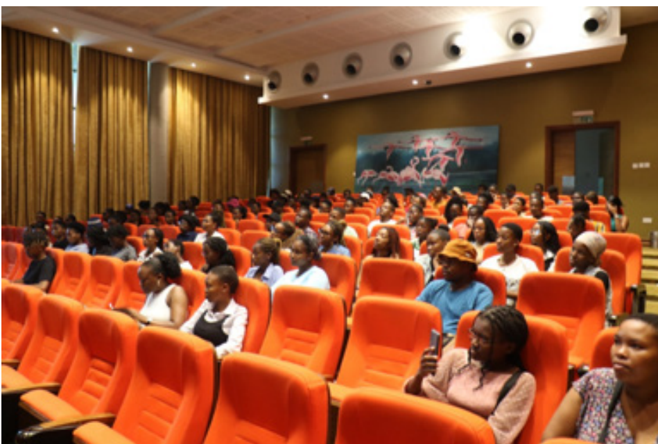
The workshop attracted a sizeable number of students who were eager to learn about Molecular Biology