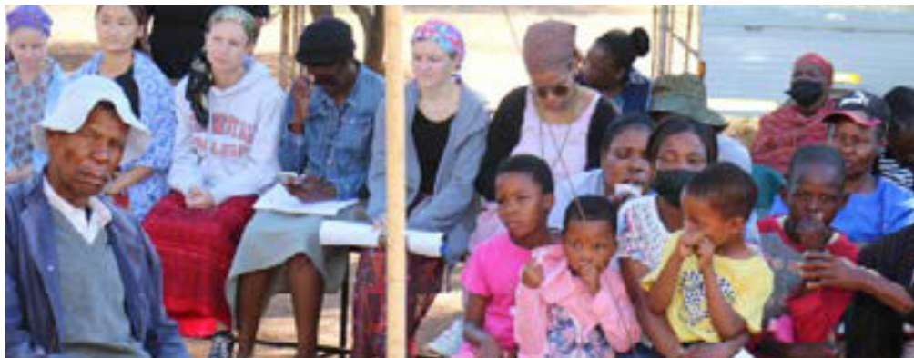
Some residents of Kgope Village interacting with UB and Boitekanelo College students. They also received information on NCDs.