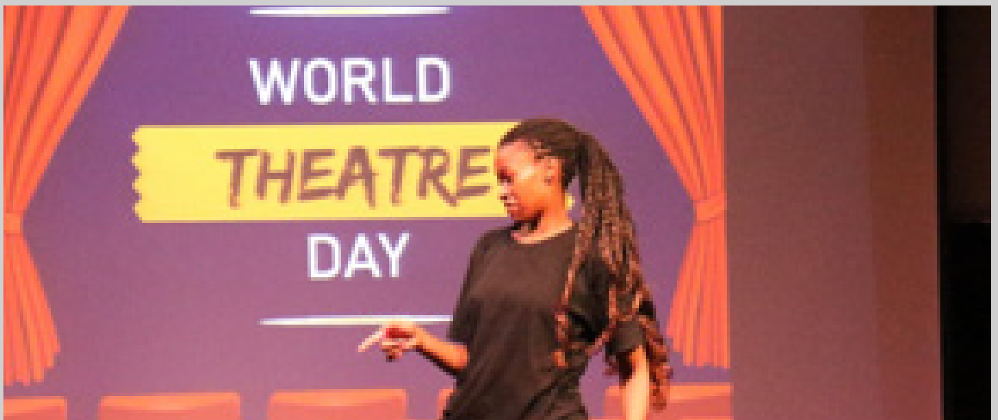
One of the VAPA students delivering a performance to celebrate World Theatre Day.