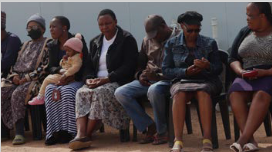
Some of the residents who attended the event waiting for their turn..

Among the tests conducted were hypertension screenings and tuberculosis checks, pivotal steps in identifying health concerns before they escalate. Furthermore, the exercise went beyond diagnostics through interactive sessions and one-on-one discussions. The students fostered a sense of empowerment among participants, equipping them with tools and knowledge to take charge of their health. ■