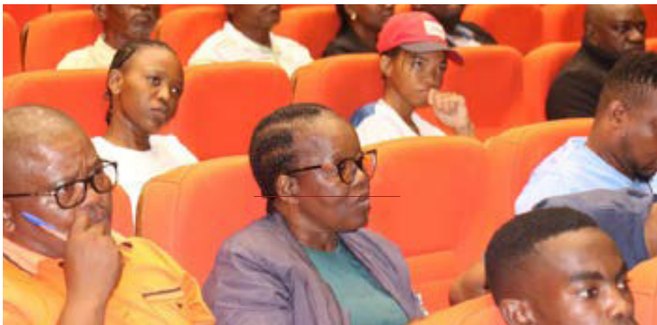
Some members of the public who attended the public lecture listening attentively.