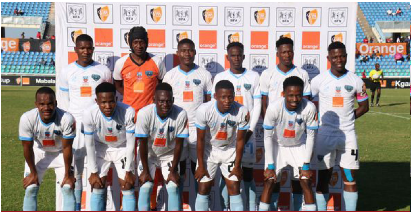
UB Hawks Football Club