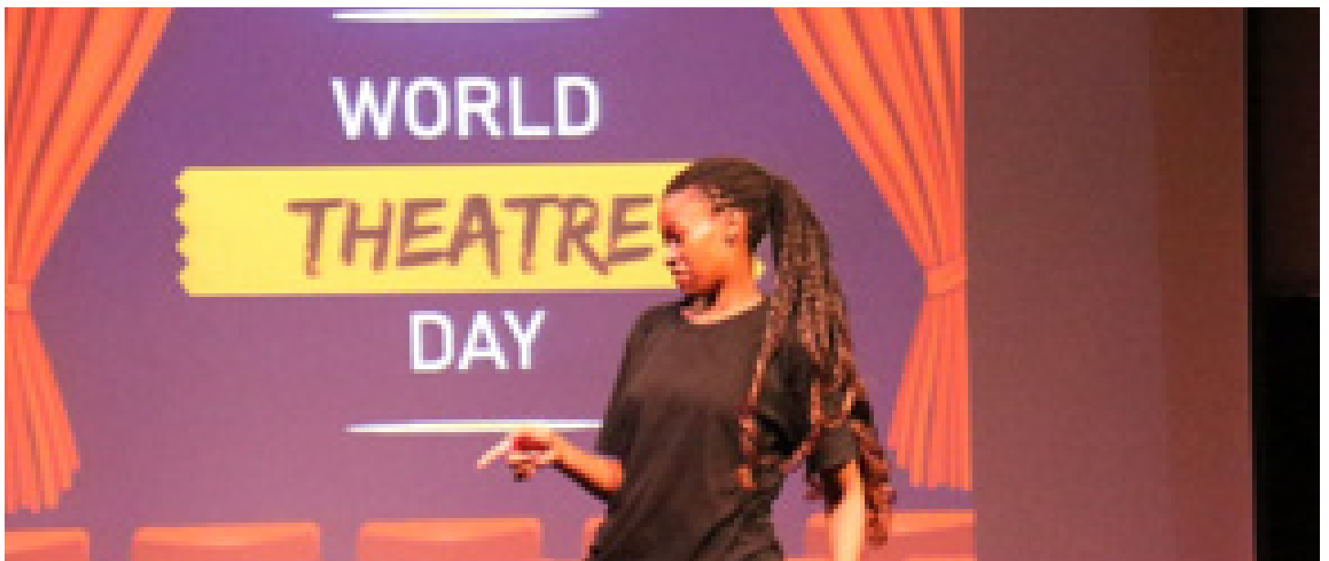
One of the VAPA students delivering a performance to celebrate World Theatre Day.