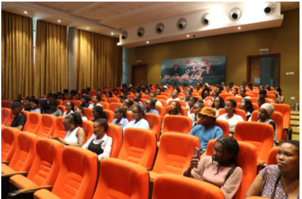
The workshop attracted a sizeable number of students who were eager to learn about Molecular Biology.