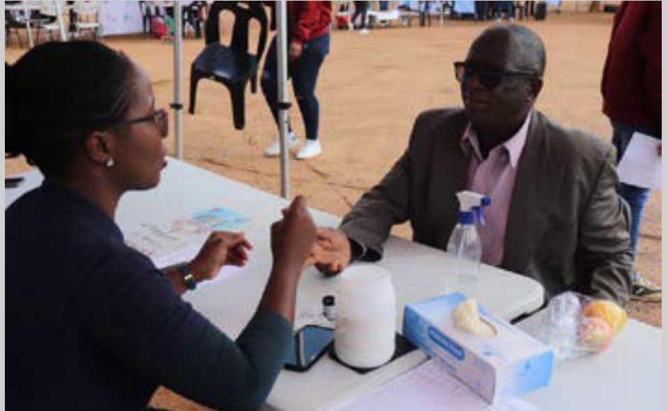
A nursing student conducting tests for NCDs on one of the residents.

"This is actually what we talk about in Primary Health Care. It is about reducing the costs on people. This is also in line with