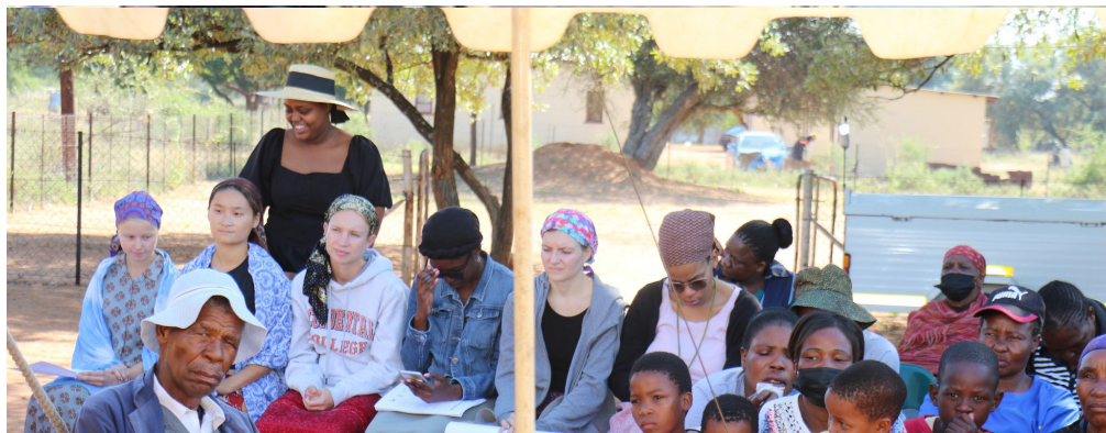
Some residents of Kgope Village interacting with UB and Boitekanelo College students. They also received information on NCDs.