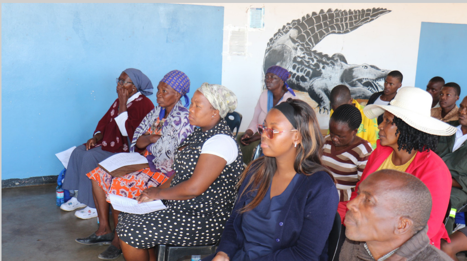
Some of the residents who attended the event awaiting their turn.

Among the tests conducted were hypertension screenings and tuberculosis checks, pivotal steps in identifying health concerns before they escalate. Furthermore, the exercise went beyond diagnostics through interactive sessions and one-on-one discussions. The students fostered a sense of empowerment among participants, equipping them with tools and knowledge to take charge of their health.