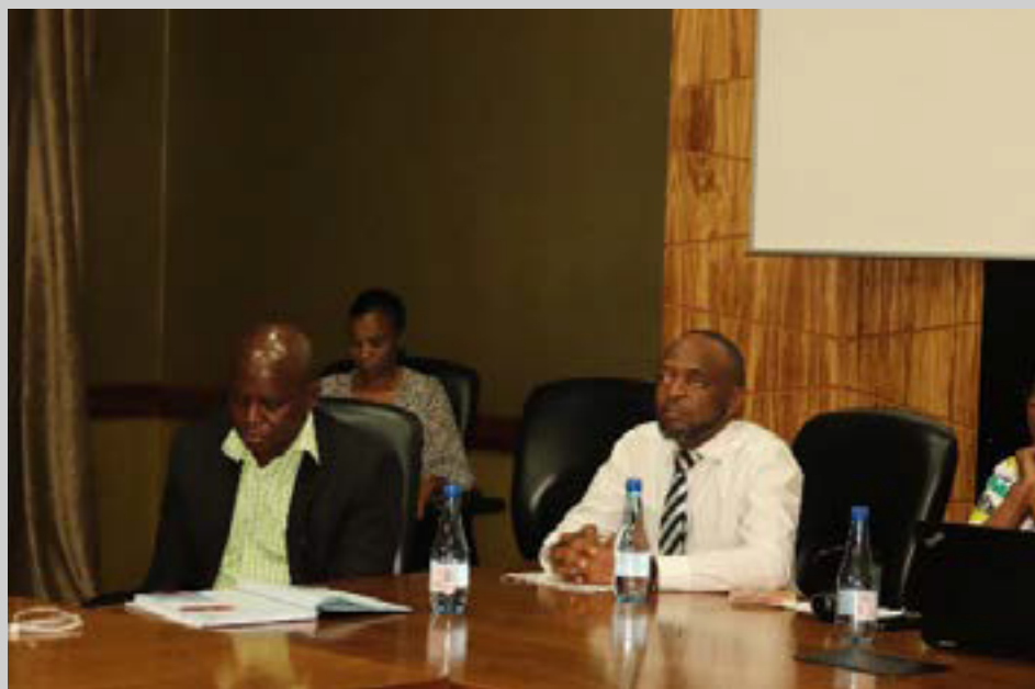
Some members of the UB Management listening attentively to the proceedings.

Furthermore, she indicated that the training was part of an ongoing process of revatilisng the institutions internal and external communications to foster cohesion among stakeholders.