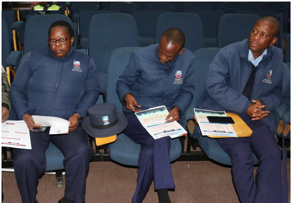
Some members of the University of Botswana Protection Services listening to the proceedings of the workshop.