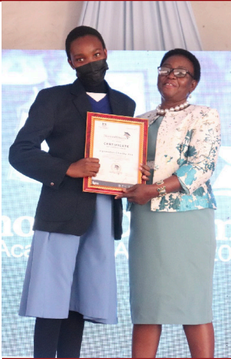
One of the students who received awards.