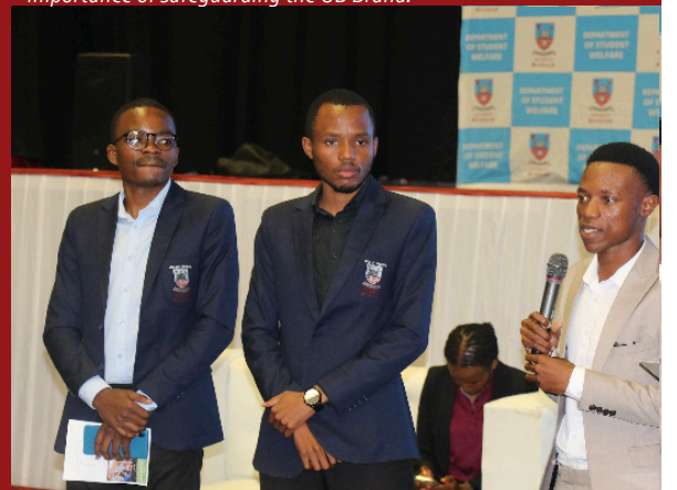
Members of the SRC addressing the students.