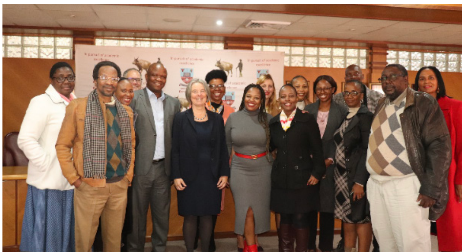
RPTU delegation with UB Management after the signing of the MoU.