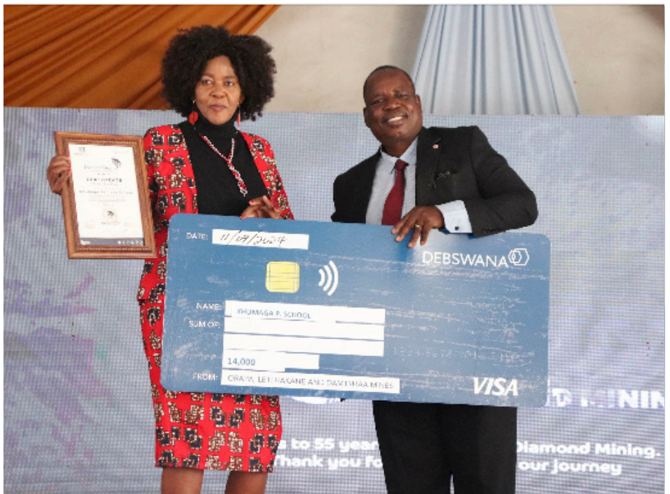
One of the teachers receiving a cheque for P14 000 for outstanding performance from Debswana Mine.

The Diamond Dreams Awards ceremony not only celebrates academic excellence but also underscores the transformative impact of education in preparing Boteti youth for a globally competitive future. As the region strives towards becoming a hub for innovation and self-reliance, initiatives such as these reaffirm the community's resilience and commitment to building a prosperous future beyond mining.