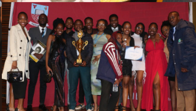
Award winning students of the University of Botswana