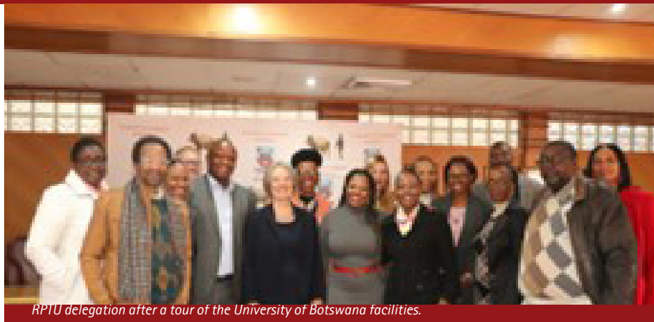
RPTU delegation after a tour of the University of Botswana facilities.

"Our goal is to assess both the positive and negative aspects of the initiative to enhance its effectiveness moving forward,"