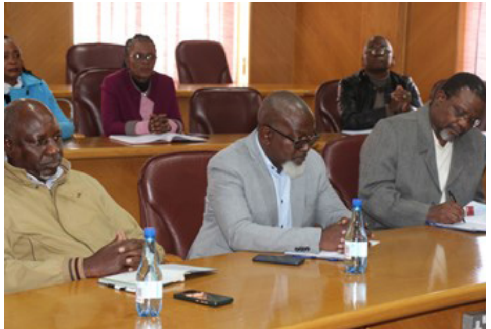
Some members of the UB Management who attended the meeting.