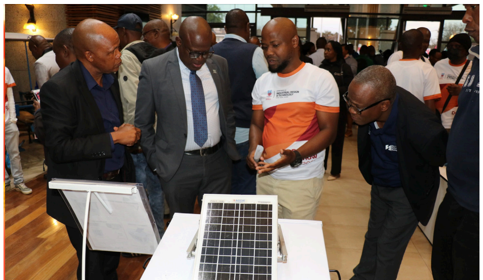
Minister Thulagano Segokgo touring some of the inventions that the students embarked on.