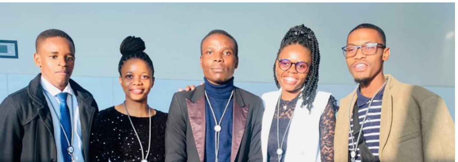
Some of the students who embarked on insightful discussions that helped them gain practical knowledge on how to leverage and integrate AI into their learning processes and prepare for future careers.

The conference underscored the critical importance of innovation and technology in shaping the future, inspiring students to actively engage in Botswana's development through education, research, and community involvement.