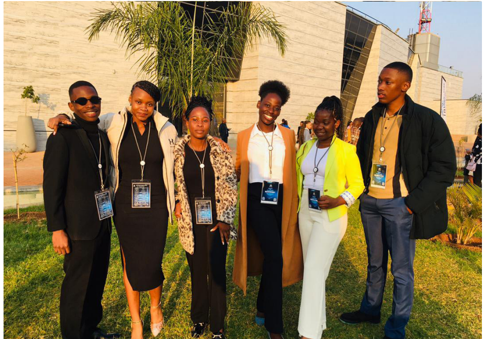
Some of the 40 UB students who attended the I'Connect Conference.