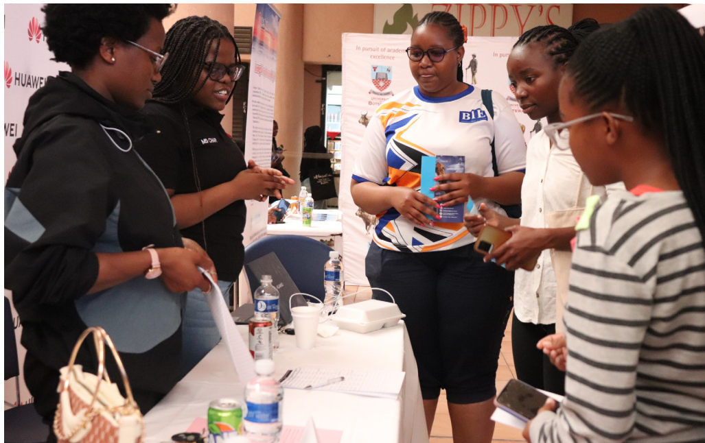
Some students visiting stalls at the Job Fair to learn about job opportunities.