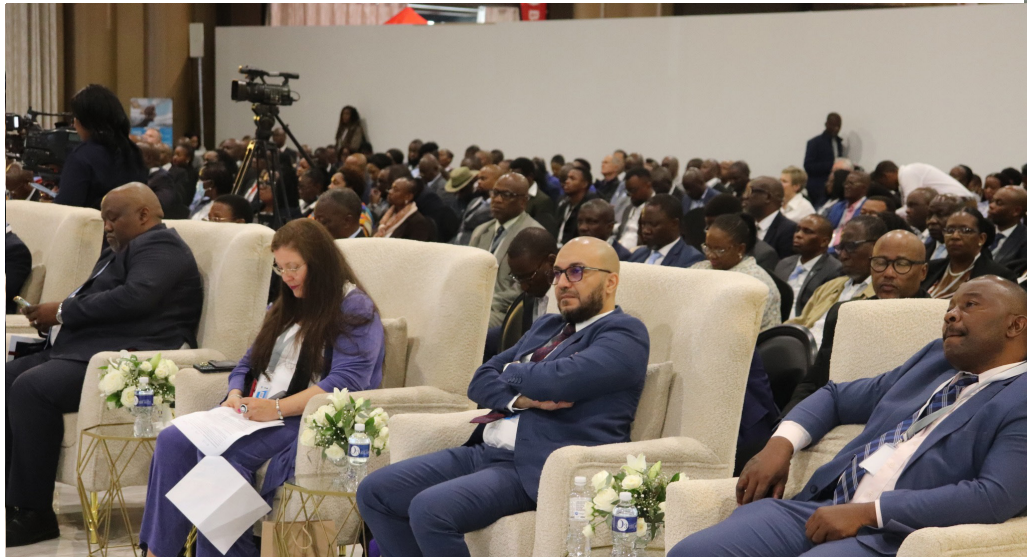
Part of the audience at the 17 th National Business Conference in Francistown.

...knowledge, a vital tool for value creation in modern economy