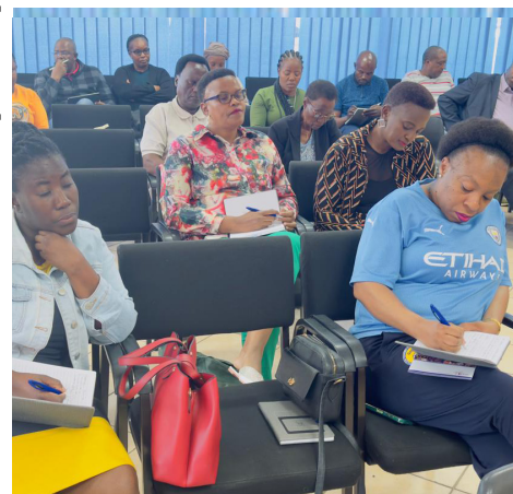
Some parents of Eswatini students at UB taking notes during the meeting.