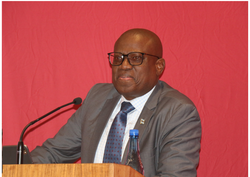
Minister Thulagano Segokgo addressing the students.

She emphasised that harnessing the power of design required collaboration between designers, public service and business. She observed that integrating design thinking with economic diversification was crucial for sustainability and driving the economic diversification agenda.