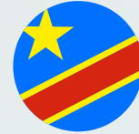
Democratic Republic of Congo