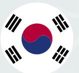
Republic of Korea