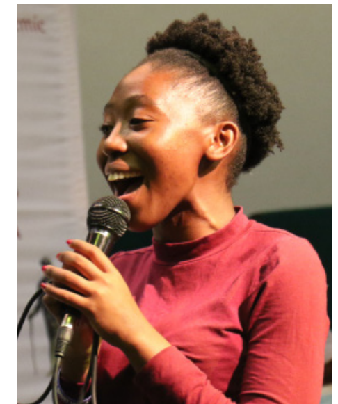
Solina, quam tu escenes aper