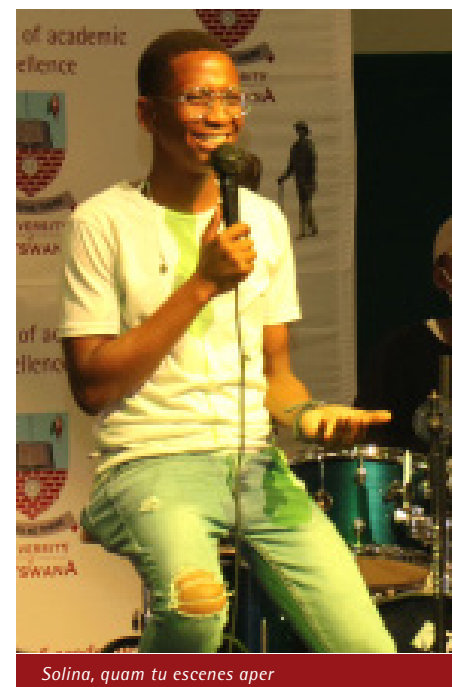
Solina, quam tu escenes aper

The Department of Visual and Performing Arts (VAPA) recently hosted The Lunch Hour Open Mic session with the aim of showcasing and unearthing talent in the University of Botswana. Participants were drawn from different faculties in the University.