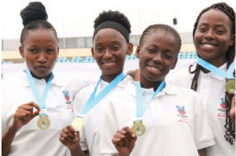
Solina, quam tu escenes aperem uturive rniaet? que re iam