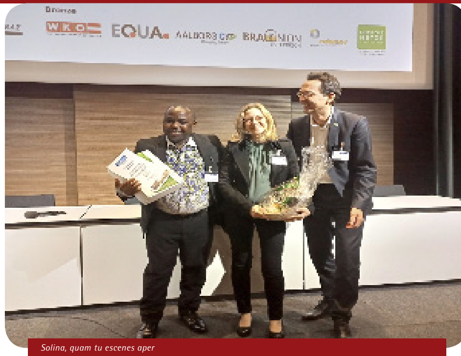
Solina, quam tu escenes aper