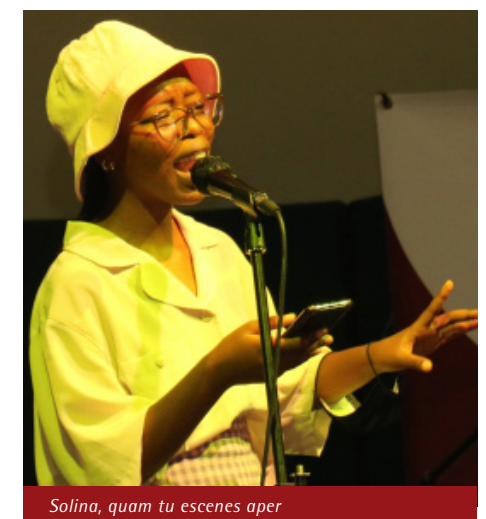
Solina, quam tu escenes aper