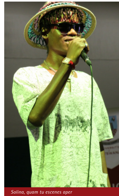
Solina, quam tu escenes aper