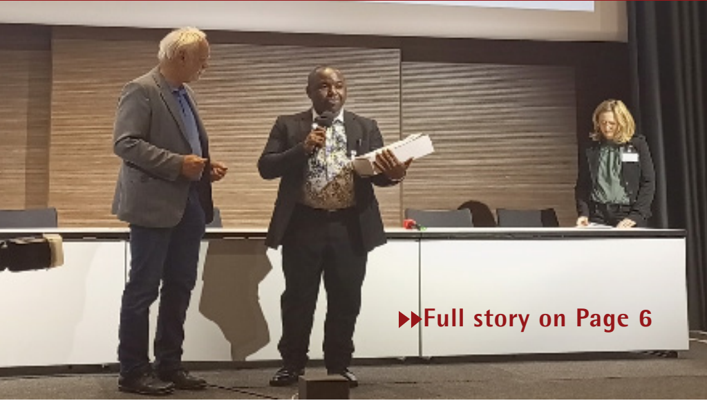
Full story on Page 6